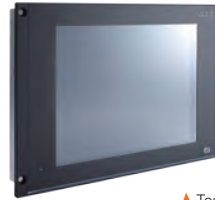
▲ Touch without keypad version